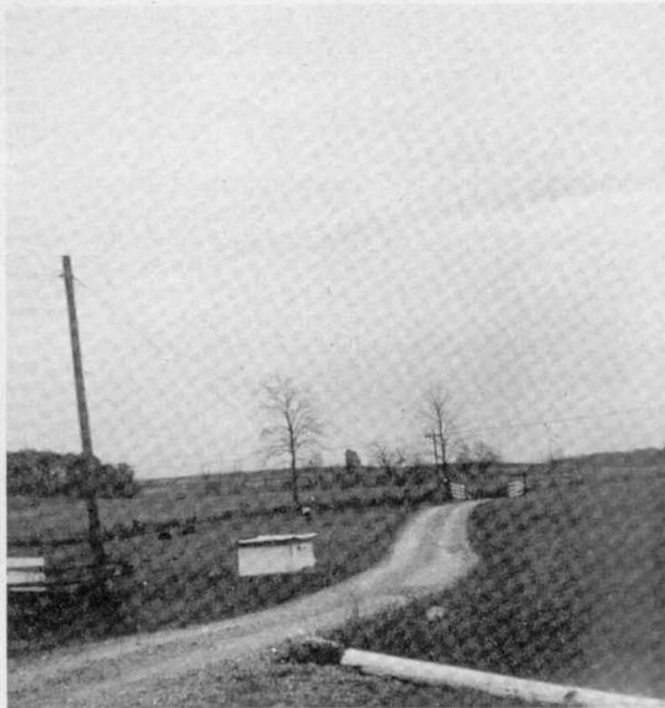
Driveway, water tank and lighted pole behind which UFO passed